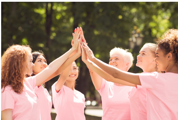
Local & National MBC Patient Advocates, Caretakers and Attendees

MBC Stories: “Illuminating the Path: MBC Awareness and Inspiration”